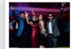
FRESHERS' & FAREWELL PARTIES