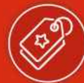
STRONG BRAND IDENTITY