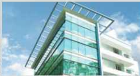
BENGALURU - KORAMANGALA