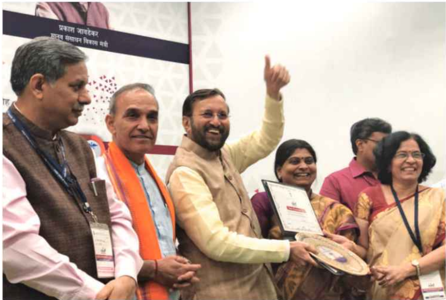
NIRF Ranking 2018