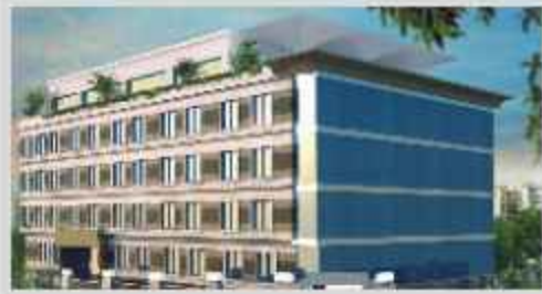
HYDERABAD - TARNAKA