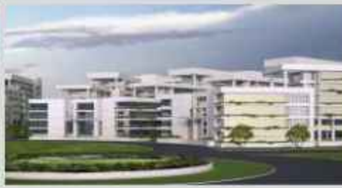
HYDERABAD - JADCHARELA