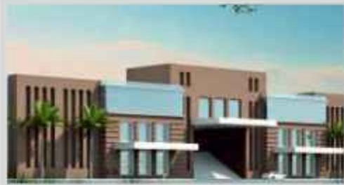
BENGALURU - BANNERGHATTA