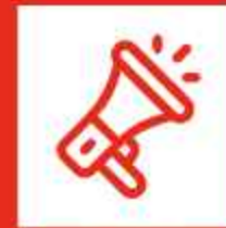
Branding & Advertising