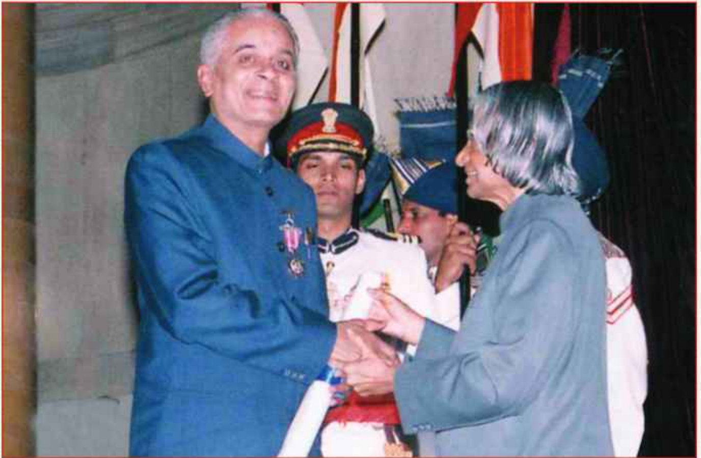
'Padma Shri' at the hands of H. E. Dr. A.P.J. Adbul Kalam, President of India (2005)