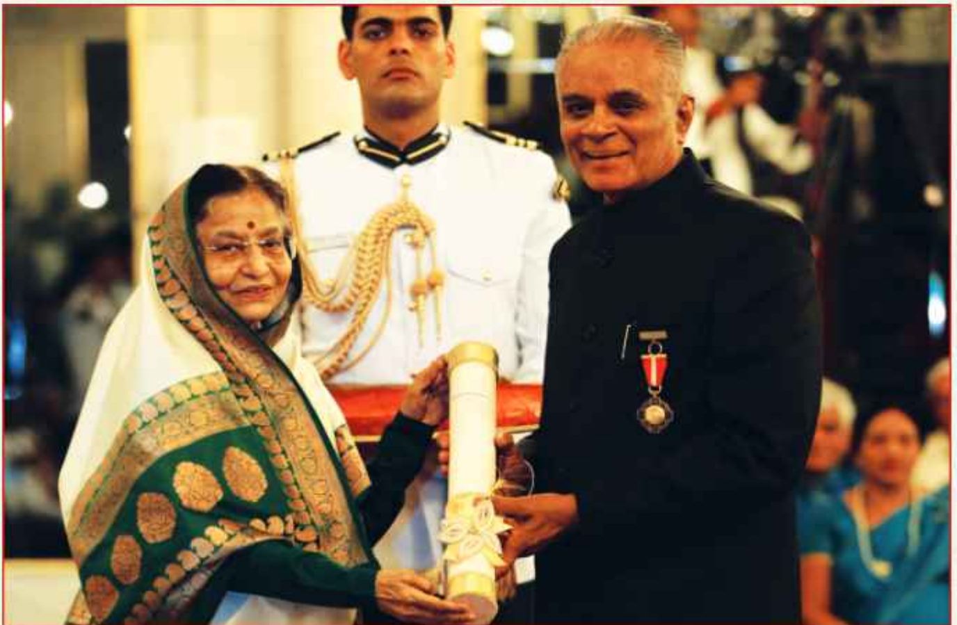
'Padma Bhushan' at the hands of H. E. Smt. Pratibha Patil, President of India (2012)